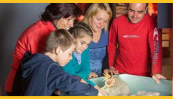
Unique fossils remain at the GEO Museum of Radein/Redagno.