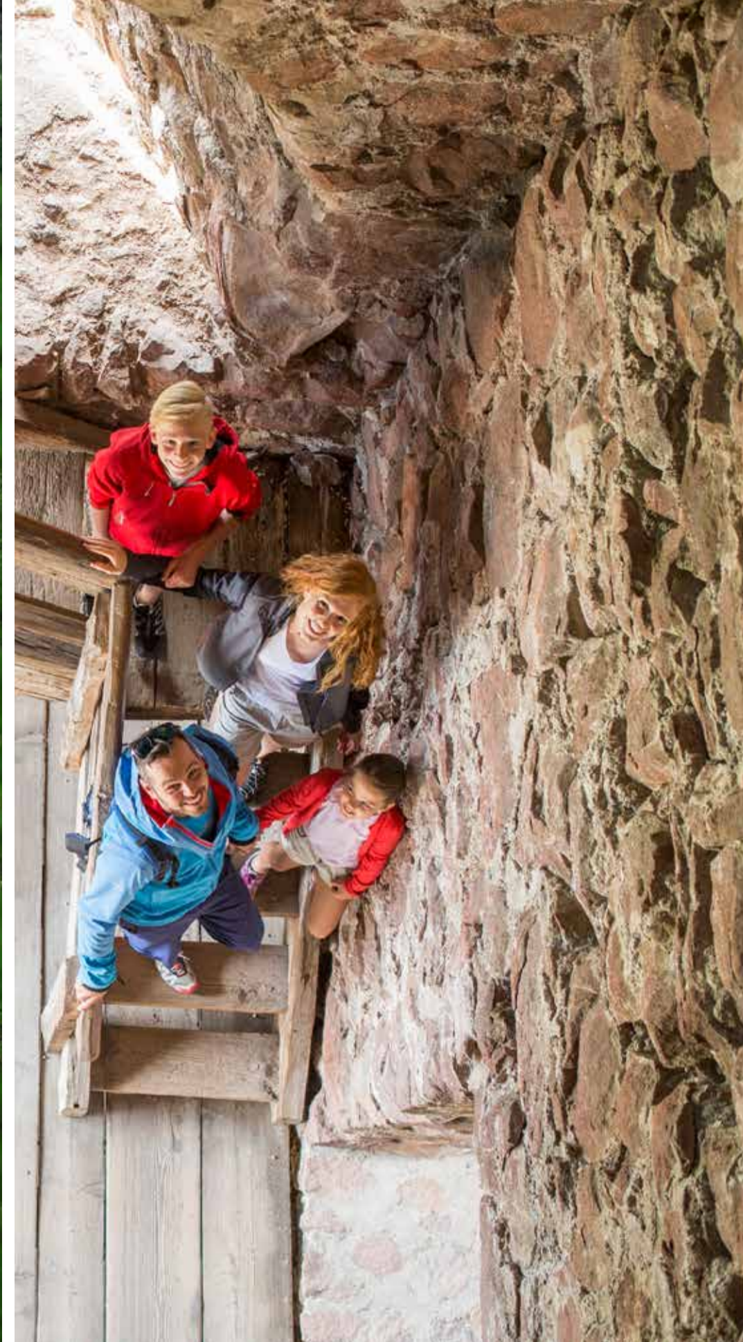
< Bolzano and environs features many castles and manors. Appiano is one of the most castle-rich regions in Europe. Some of the historic buildings now serve as a hotel, museum or, like Haderburg Castle (left) or Boymont Castle (right) as a castle inn.

Sleeping like an earl | A magical four-star castle hotel, an opulent Garni-hotel or a lordly residence: at Bolzano and environs you can lodge in such historic walls the whole year. History, culture and tradition combined with modern comfort transform your holiday into an exciting journey through time. www.bolzanosurroundings.info/castles